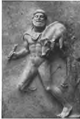
Fig. 68. Heracles carrying the Boar.

complished by turning the course of the river Alphe'us so that it flowed through the stables. King Augeas cheated him of the reward he had promised, and later, when he was free, Heracles took vengeance upon him and, at the same time,